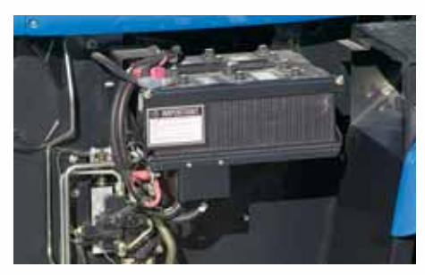
12-volt starting systems and heavy-duty batteries provide faster cold-weather starts on all models.